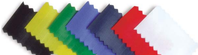
Black 024 Yellow 026 Kelly Green 029 Royal Blue 027 Navy 028 Red 025 White 023