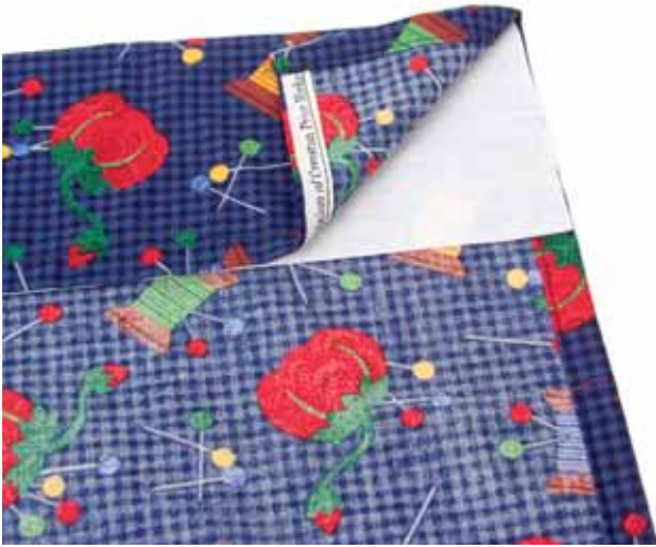
Fig. 2 finish top of drapery with heading stabilizer